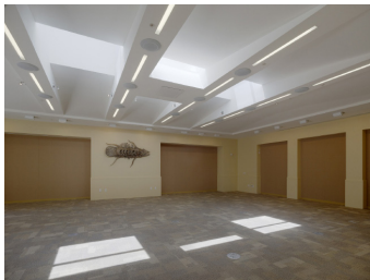
TAMALPAIS ROOM (2ND FLOOR)

TERRACE Our only outdoor space, the Terrace can be rented in conjunction with other rooms or as a stand-alone area. With views of the Berkeley hills, and featuring stunning landscape design, the Terrace is a great space for a cocktail mixer, meal seating, or for informal gatherings.