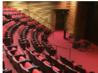
RICHARD & RHODA GOLDMAN THEATER