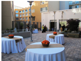
TERRACE (2ND FLOOR)